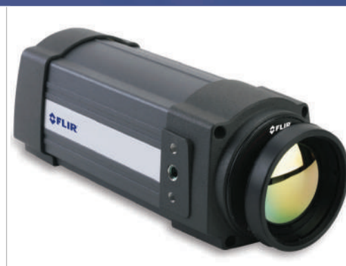
FLIR A320 TEMPSCREEN