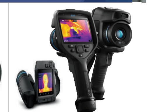
Options of Fixed or Handheld