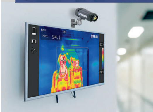
Easy Integration with Existing System